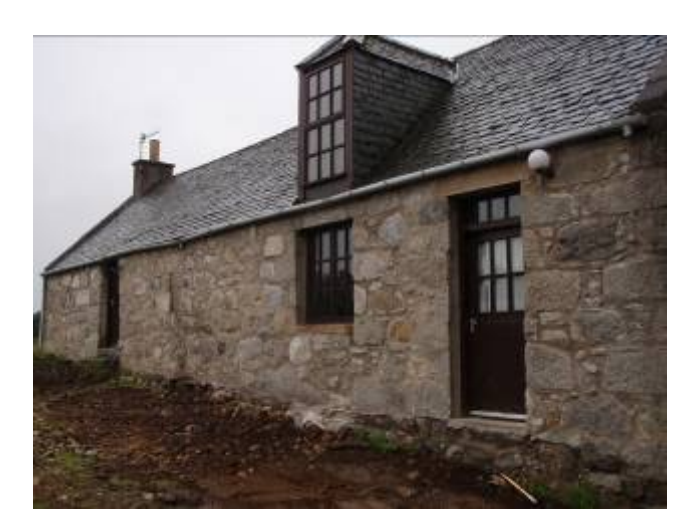
Fig. 3 - East Elevation