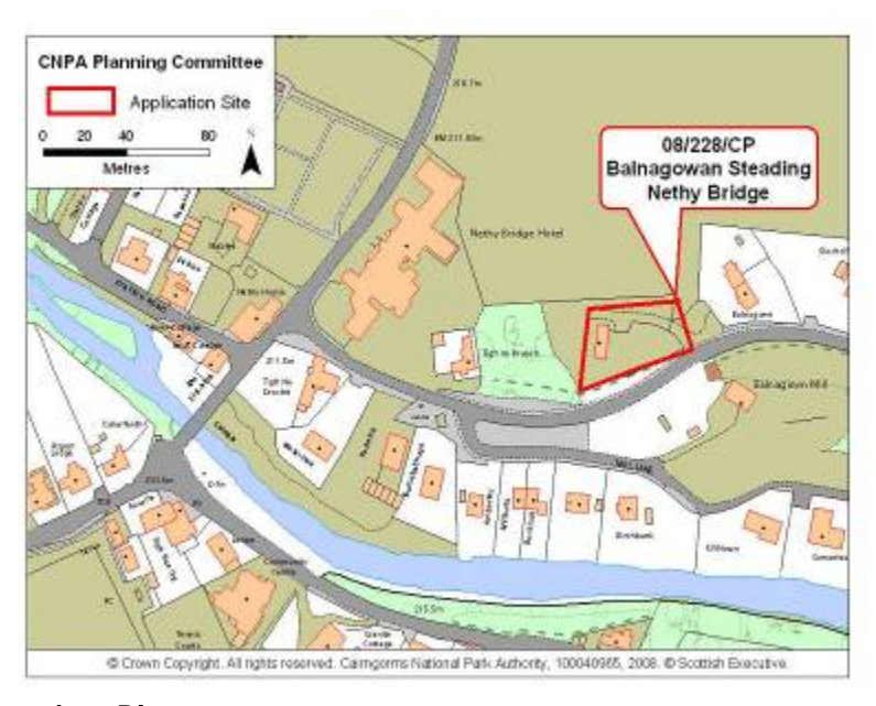
Fig. 1 - Location Plan