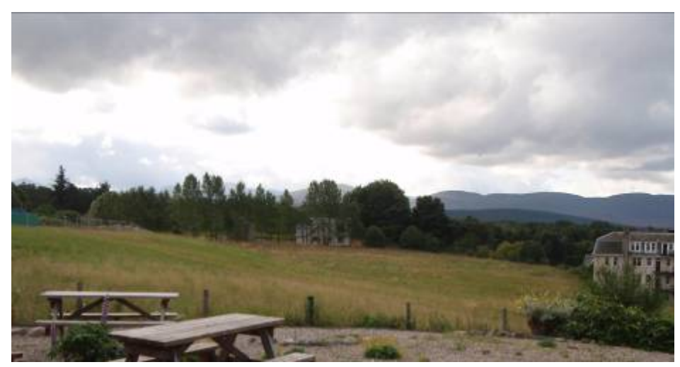
Fig. 5 - Looking South from Mountview Hotel, across the amenity open space. Balnagowan steading and the adjacent new house in the middle distance.