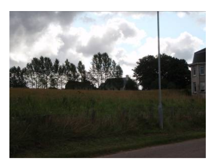
Fig. 6 - Balnagowan steading and the adjacent new house viewed across the open amenity land from Grantown Road

5. To the South and East, Balnagowan Brae, the public road, is bound by trees and embankments descending Westwards, towards the village. Beyond the trees to the South, are distant views of the Cairngorm mountain range. The opposite (southern) embankment has been cultivated as a small public amenity space, including a seat and viewpoint towards the village. The site and existing steading are visible from this point and from the Brae as it approaches the village centre from the East (Dorbrack).