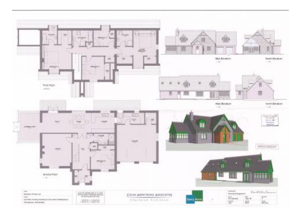
Fig. 9 - Elevations and Plans