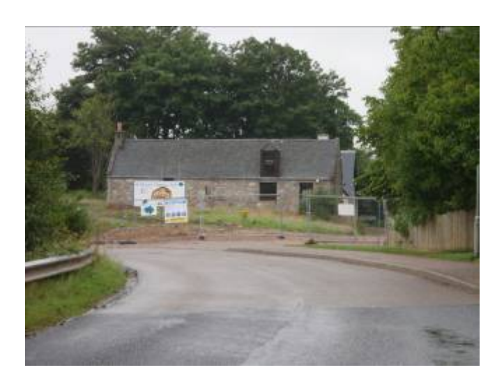
Fig. 2 - Balnagowan Steading looking West from Balnagowan Brae