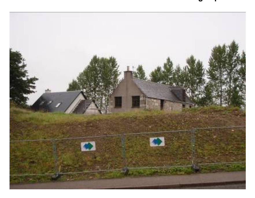
Fig. 7 - Balnagowan steading viewed from the amenity area on Balnagowan Brae